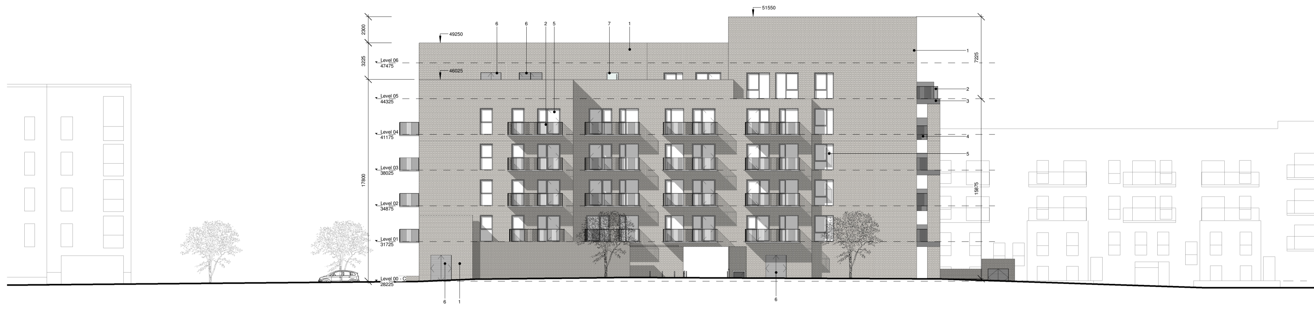
1 Block A - North Elevation 1 : 200