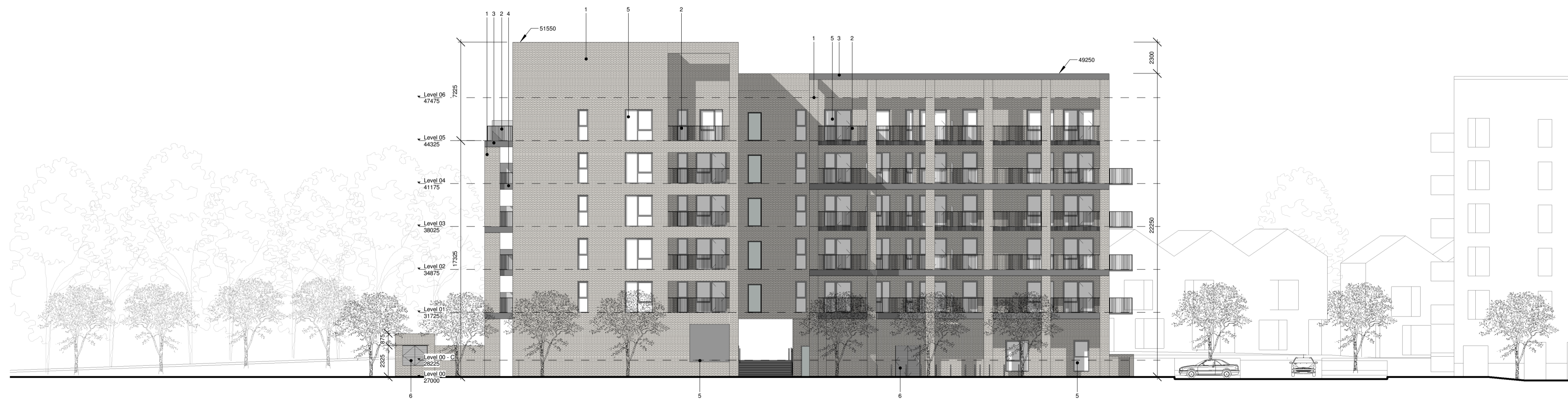
2 Block A - South Elevation 1 : 200